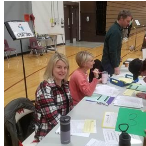
Utility Booth Simulation

Over 300 students participated in the simulation moving between 20 booths making financial decisions to pay for life's necessities and wants. The goal of the simulation was to have between $5 and $200 left in their monthly check register after entering expenses, investing, and savings. Many students ended up having a net loss at the end of the month and had to reevaluate their financial decisions.